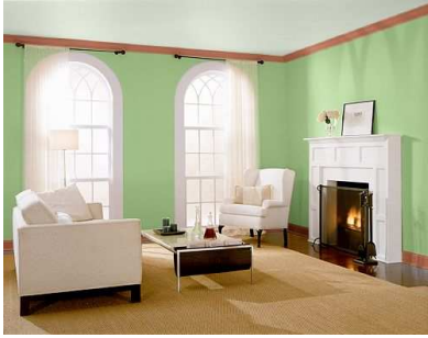
Living Room 3